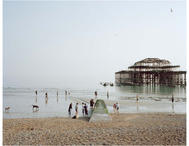
Brighton West Pier, East Sussex, April 2011, Edition 4, 122 x 152 cm / 48 x 60 inch