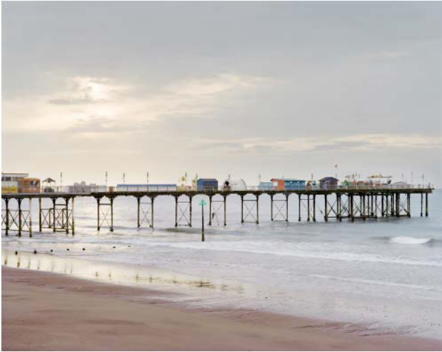
Teignmouth Grand Pier, Devon, July 2011, Edition 4, 122 x 152 cm / 48 x 60 inch