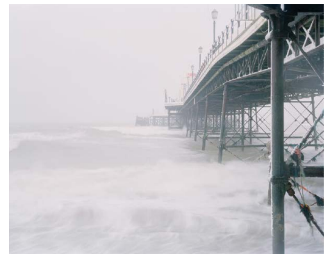
Bangor Garth Pier, North Wales, 2011