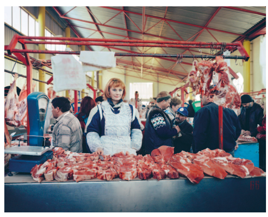
Meat market, Pyatigorsk, March 2005, from Motherland, 2007

and ends on a park bench in Moscow. Frank also seems to travel east to west, starting his book in New Jersey and ending it in Texas. Along the way the two men become acquainted with each country's people: in Miami Beach, Frank photographs the elevator girl; and in Pyatigorsk,